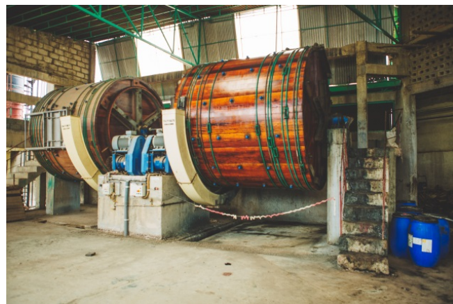
Tanning drums