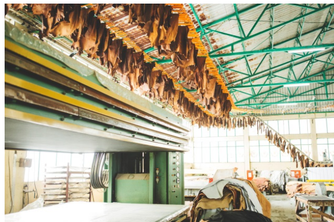
Hides drying