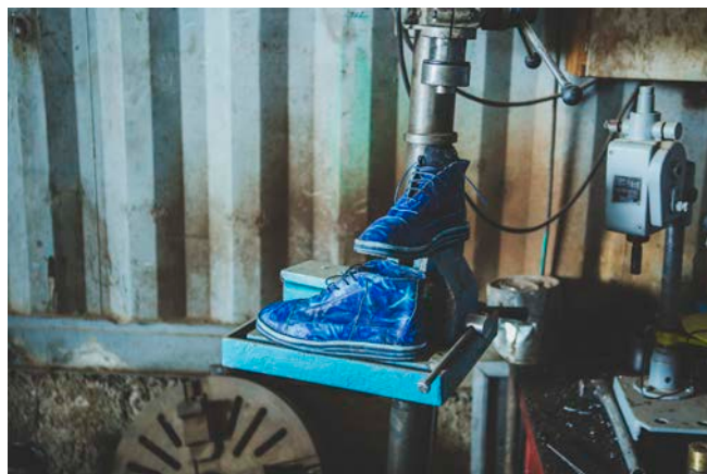
Shoes produced at HAFDE