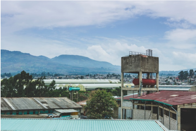
HAFDE tannery