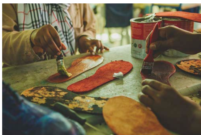
Shoes production at HAFDE