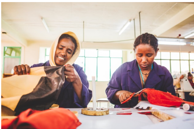
Bag lining © Louis Nderi and EFI