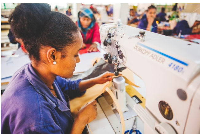
Bag stitching